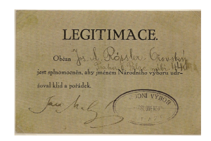
AUTORIZATION (REVERSE) Official identification card authorized by the National Government to maintain the service in optima peace conditions.

At the end of October, 1918, the first days of Independence of the Czechoslovak Republic, the National Committee of Prague created an auxiliary service of scouts for mail delivery.