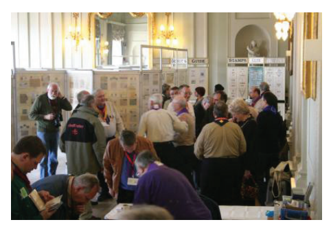
General view of Ehibitors, SGSC and Trading