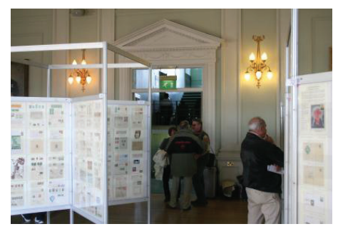
Central Exhibit by Hallvard Slettebo