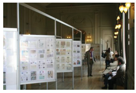
General view of framed exhibits